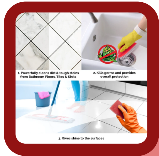
BATHROOM AND FLOOR CLEANER