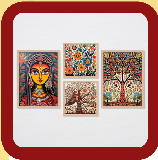
PAINTING ARTWORKS / POSTER