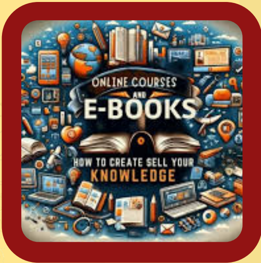
DIGITAL COURSES AND E-BOOKS